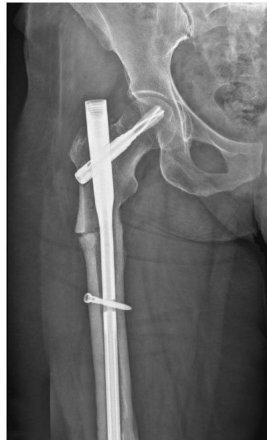
Figure 3: A 72-year-old female with a three-year history of taking bisphosphonates presented after a low energy fall resulting in a right atypical femoral fracture treated with a Proximal Femoral Nail Antirotation (PFNA)