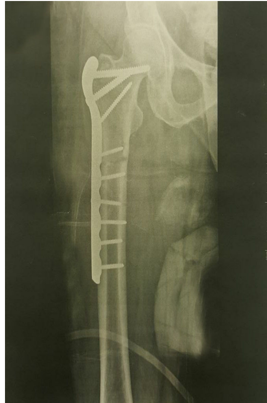
Figure 1: A 74-year-old female with a two-year history of taking bisphosphonates presented after a low energy fall resulting in a right atypical femoral fracture treated with a plate