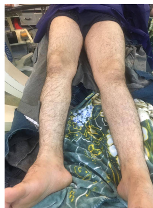
Figure 1: Abduction of left hip in emergency ward before reduction

Physical examination showed his left hip abducted 20° flexion 0° and external rotation of 10° (Fig. 1). Motion of hip was painful and restricted.