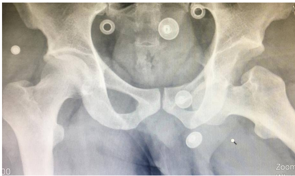
Figure 2: Anteroposterior radiograph of the pelvis showing an obturator dislocation of the left hip

The femoral pulse was weaker than the other side and neurologic exam showed femoral nerve palsy. Patient had parasthesia in anteromedial of thigh and could not extend left knee without any contraction in quadriceps muscle at arrival. X-ray findings revealed obturator hip dislocation, no associated fracture was seen (Fig. 2).